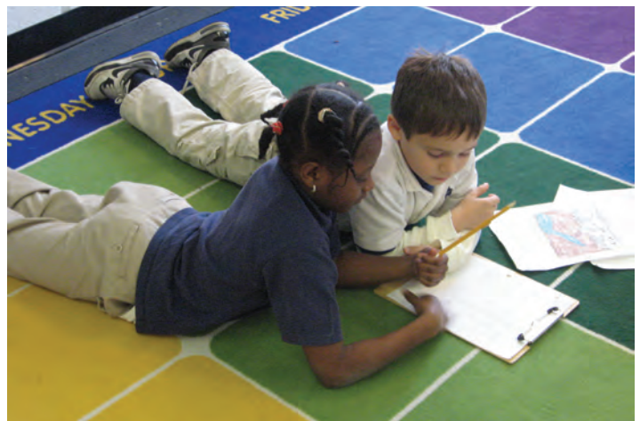
SBCS 2nd Graders collaborating on a project.

This February, SBCS was one of 3 schools to be given a full 5 year charter renewal by the Baltimore City Public School System Board of Commissioners. While several other schools received 2 year renewals and one school’s charter was revoked, SBCS had the best possible outcome: another 5 years. We are very proud and pleased that in all categories—academic achievement, culture and community engagement, and organizational viability—we scored well. We are excited about the next 5 years, and look forward to making our strong school even stronger.