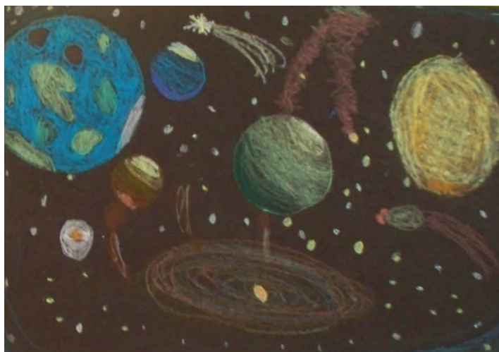
Artwork by an SBCS 4th Grader during the Solar System Expedition