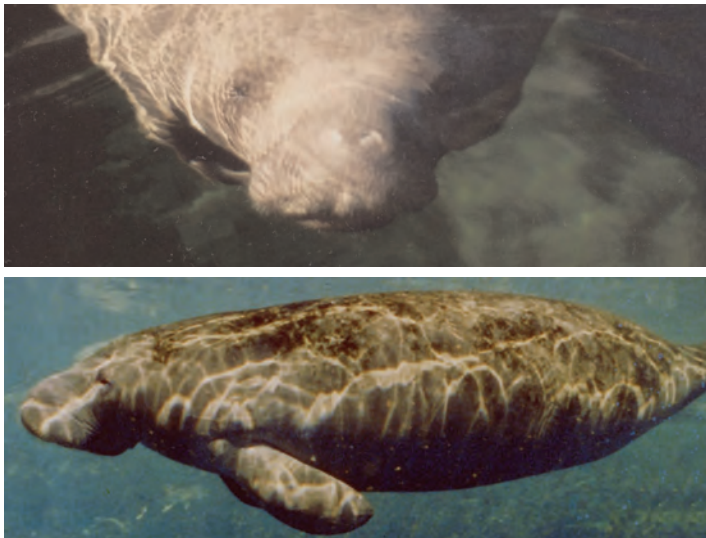
Dana (top) and Rosie, the two adopted manatees by the first grade.

The culmination of first grade's expedition on Manatees was pretty spectacular. They made rice krispie treats and sold them to other SBCS students during lunch time in order to raise money to adopt a Florida manatee. The first graders raised enough money to adopt two endangered manatees. Their donation went directly to the Save the Manatee Foundation, and now Dana and Rosie are part of the SBCS Family.